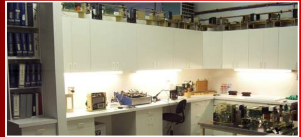
Additional Assembly & Module Repair Area