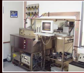
Permanently Install Tegal 901e Through-The -Wall Test Bed